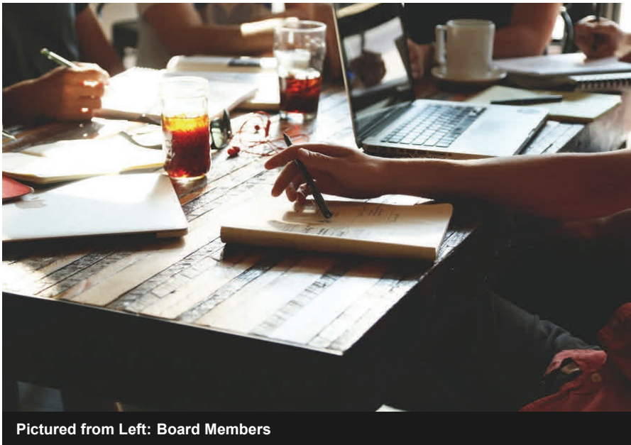
Pictured from Left: Board Members